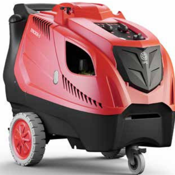
WITH NO-MARKING RUBBER WHEELS