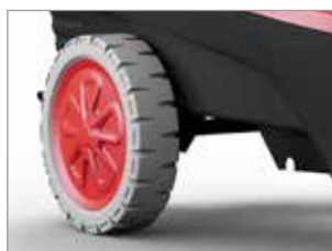
LARGE WHEELS IMPROVE MANEUVERABILITY AND EASE TRANSPORT.