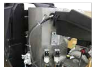
3 STAGE HIGH EFFICIENCY BOILER WITH AISI 316 STAINLESS STEEL STRUCTURE.